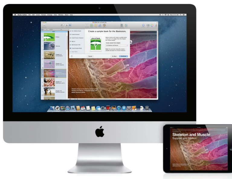
Image-3. Made for iPad.

reading electronic books. We can injure our eyes, if there is magnetic currents it may bring brain tumor, but if we will use this books by time breaking there shouldn't be much problem. Because it is harmful for children to carry heavy books which may cause forming curvature of the spine, with topics which they have seen before and will see later. So there is no need to take them all by yourself. Its really interesting to use electronic books at learning societies, finding topic to repeat, pages to find, remark or highlight, taking notes by learning these are giving more convenience for learner.