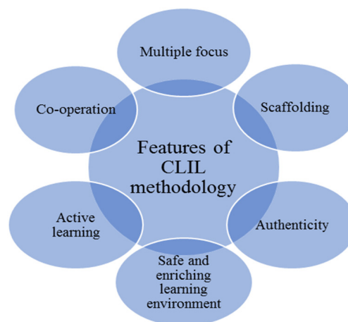
Figure 2 – Core features of CLIL methodology

mastering foreign languages, students learn the material, which demonstrates the functioning of the language in a natural environment; it comes with the help of authentic materials (Yessengaliyeva et.al, 2016: 139).